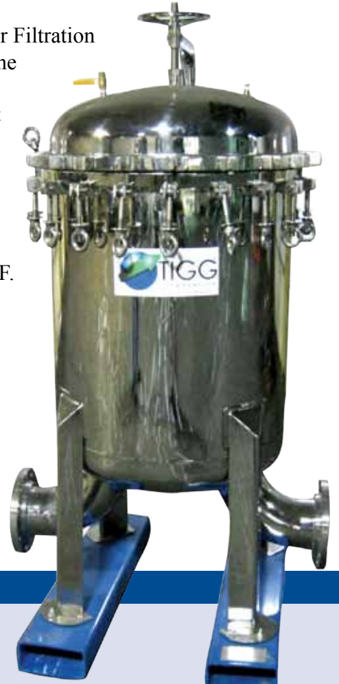
This 6-cavity unit is available for sale or rent

The individual filtration bags are made of polyester, nomex and PTFE and are available in sizes 0.5 to 200 microns. These units are available for both sale and rental.